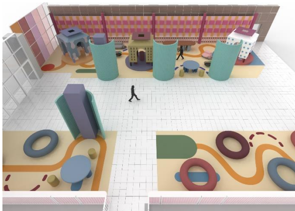
Elena Salmistraro's designs are imaginative, colourful and cheerful - as is the rendering for the special show 'The Lounge' at Ambiente 2024. Photo: Elena Salmistraro.

Ambiente will continue to be held at the same time as Christmasworld and Creativeworld at the Frankfurt Fair and Exhibition Centre: