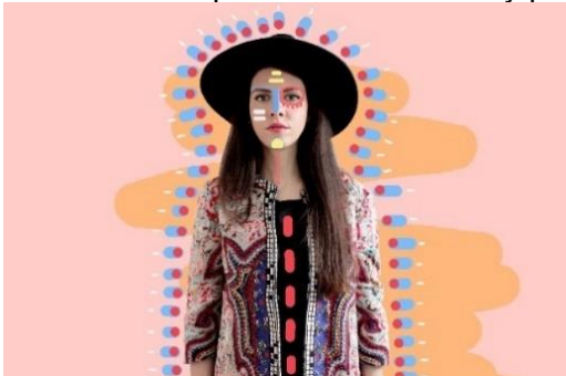
She is regarded as a new force on the contemporary international design scene: The Milanese artist and product designer Elena Salmistraro. Photo: Elena Salmistraro.